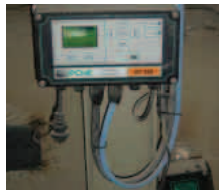
Product loss prevented by silo monitoring

Stacks are not always dry. Many locations have very moist conditions which prevent the use of most technologies. PCME's unique, patented, fully insulated Electrodynamic sensors overcome this problem to provide accurate calibrated data. In some instances, instruments have been continually used in these aggressive applications for over ten years with little or no maintenance.