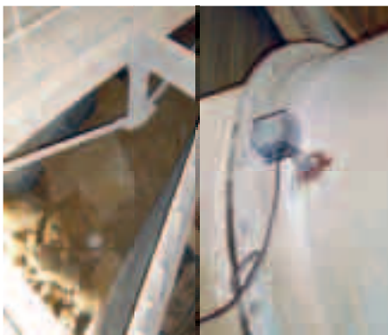
Crusher plant filter protected by an advanced Electrodynamic unit