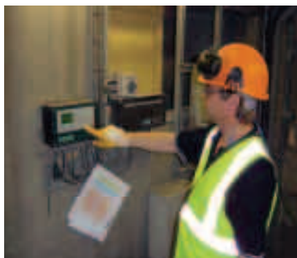
Filter condition assessed remotely

PCME's environmental monitoring range encompass many different technologies to provide the best solution for each application and provide enhanced benefits for users. Set out below are a selection of proven solutions for the Cement industry, for further details please contact us directly on sales@pcme.co.uk or discuss your requirements with our experienced team of local distributors.