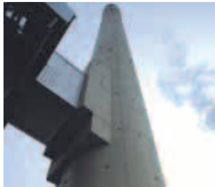
Kiln stack and electro-filter monitored by Dynamic Opacity Instrumentation

Operations such as crushing and milling using filters to prevent dust emissions can be successfully monitored using either simple filter failure devices or advanced calibrateable systems depending on local requirements. Electrodynamic systems are the best suited to monitor these relatively small diameter stacks with low dust loads of typically 5 \text{ mg/m}^3 or less. These systems are virtually maintenance free and do not require additional services such as purge air.