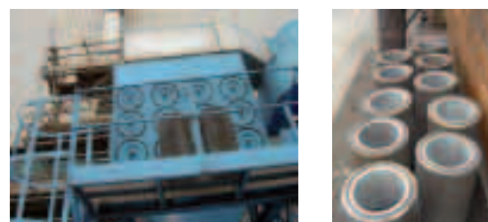
Predict offers the possibility of shorter maintenance times and the replacement of fewer filter elements