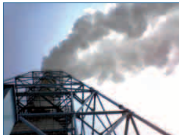
Effective electro-filter monitoring utilising PCME's Optical and Electrodynamic technologies

The ability to observe in real time the performance of the filter allows the operator to adjust operating parameters to optimise not only filter efficiency but also reduce operating costs, extend the filters operating life and decrease the environmental impact of the process.