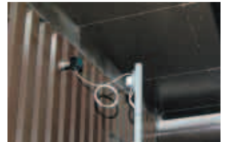
Filter chamber performance continuously monitored via a networked Electrodynamic system

Employing multiple indicative Electrodynamic sensors allow each compartment of large multi-chamber Baghouses to be constantly monitored to determine the deterioration of filter elements. These systems provide a proven method of not only reducing total environmental emissions but also allow preventative maintenance programs together with shorter plant down times and greatly reduced operating costs. Advanced Electrodynamic units can be employed pre-filter, both Electro and Bag to ascertain filter performance.