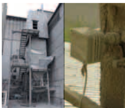
Damp cement mill monitored utilising a fully insulated sensor

Employing probe-based systems can be monitored not only for performance to comply with environmental legislation but by utilising PCME's unique Predict software package, the monitor can be used as a powerful filter maintenance tool. This not only greatly reduces maintenance time and costs but eliminates the dirty and difficult job of identifying row failure by permitting remote identification.